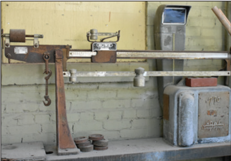
This antique scale was used thousands of times back in the day.