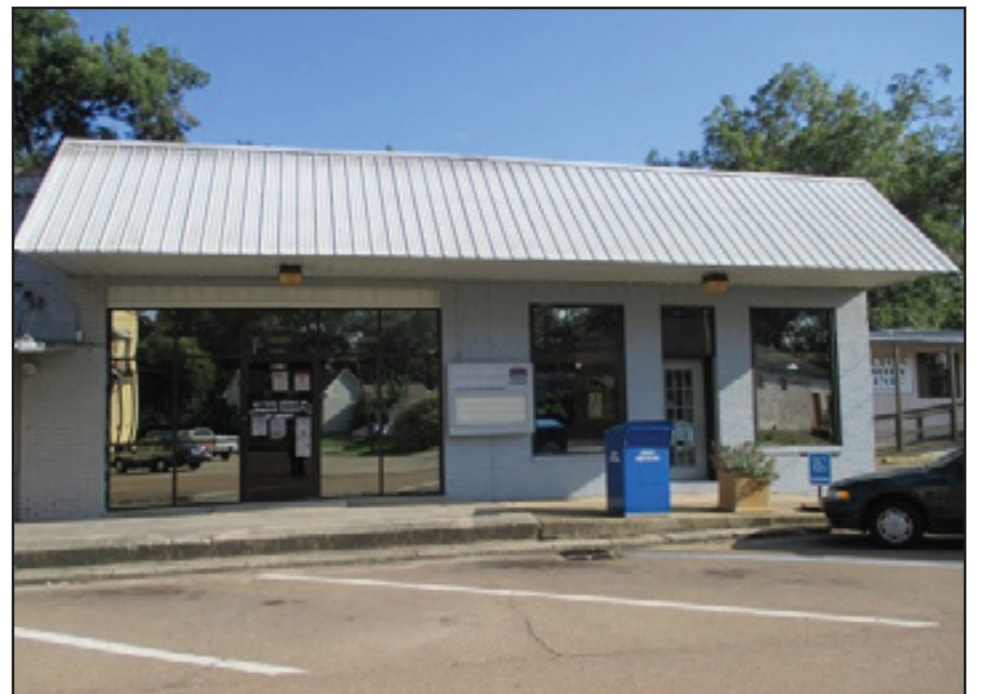
Special to The Bolton News