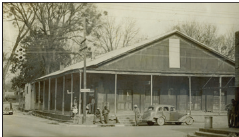
Special to The Bolton News

To view more photographs, past and present, of the Gaddis & McLaurin store, visit the extended online edition of The Bolton News, pages 4 and 5, available at www.BoltonMS.com .