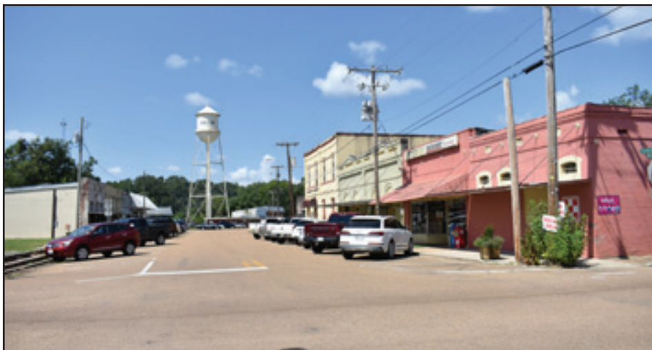
Bolton's iconic water tower and a view of Madison Street. Gaddis & McLaurin is on the right.